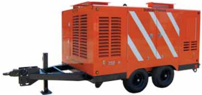
750 CFM TO 900 CFM