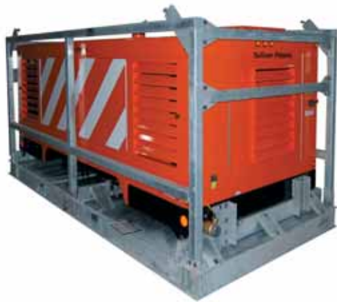
185 CFM TO 1800 CFM OFF SHORE COMPRESSOR