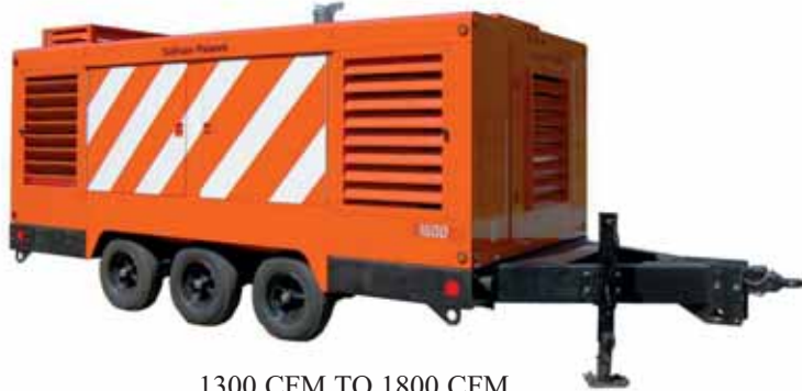
1300 CFM TO 1800 CFM