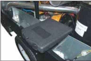
Manual Holder (optional) Equipped with Operating Manual Holder

Optional Panel: The optional panel consists of standard panel plus air oil separator indicator, tachometer, air filter indicator, fuel solenoid circuit breaker and starter breaker switches, discharge air temperature, voltmeter gauge, and ether starting.