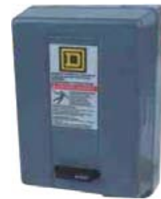
Single and Three Phase Magnetic Starters